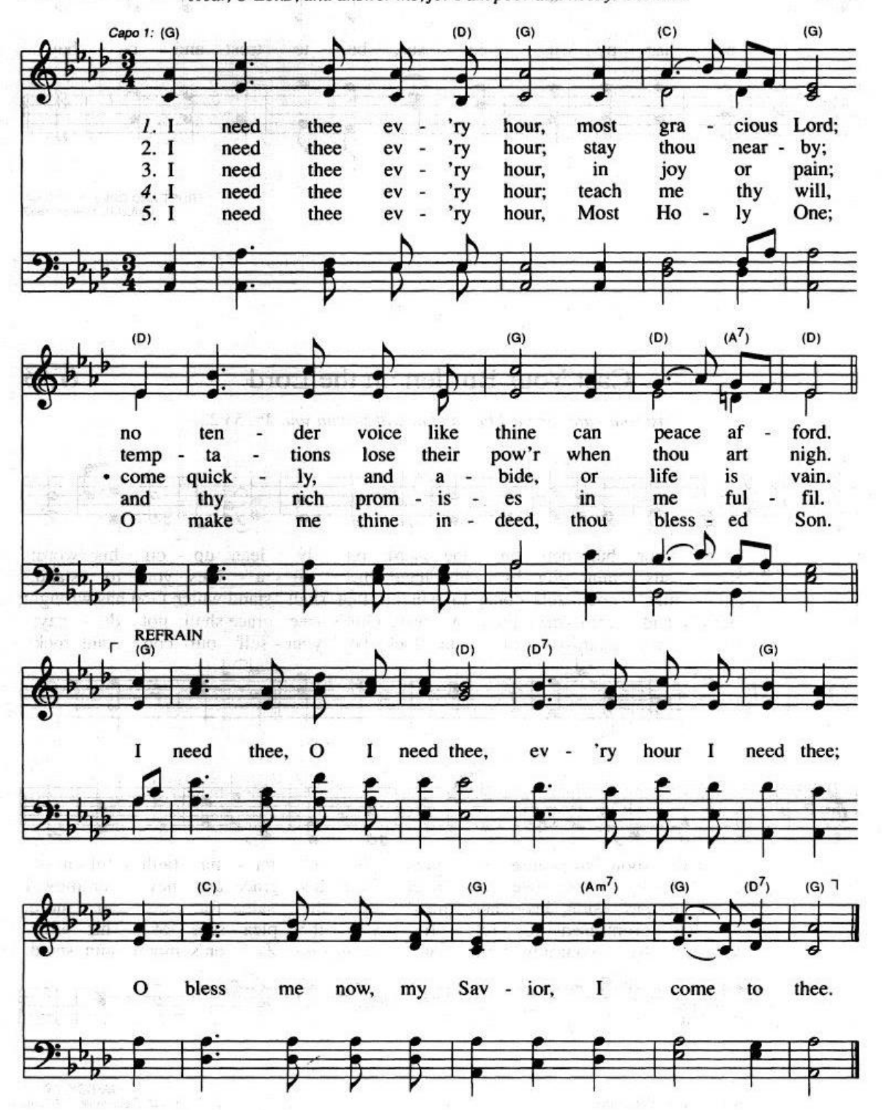
Hear, O LORD, and answer me, for I am poor and needy. Ps. 86:1